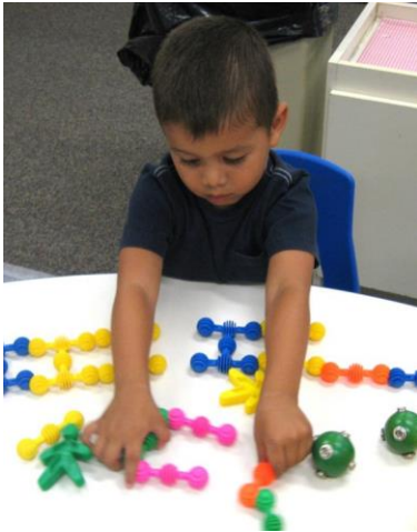
Promoting math skills among preschoolers, through a Teacher Mini Grant.