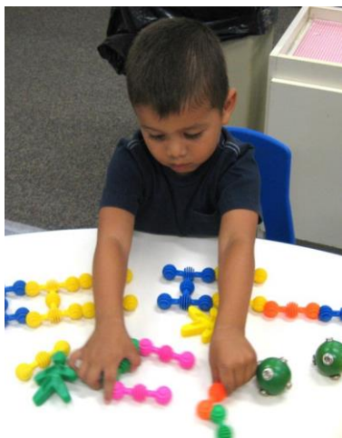
Promoting math skills among preschoolers, through a Teacher Mini Grant.